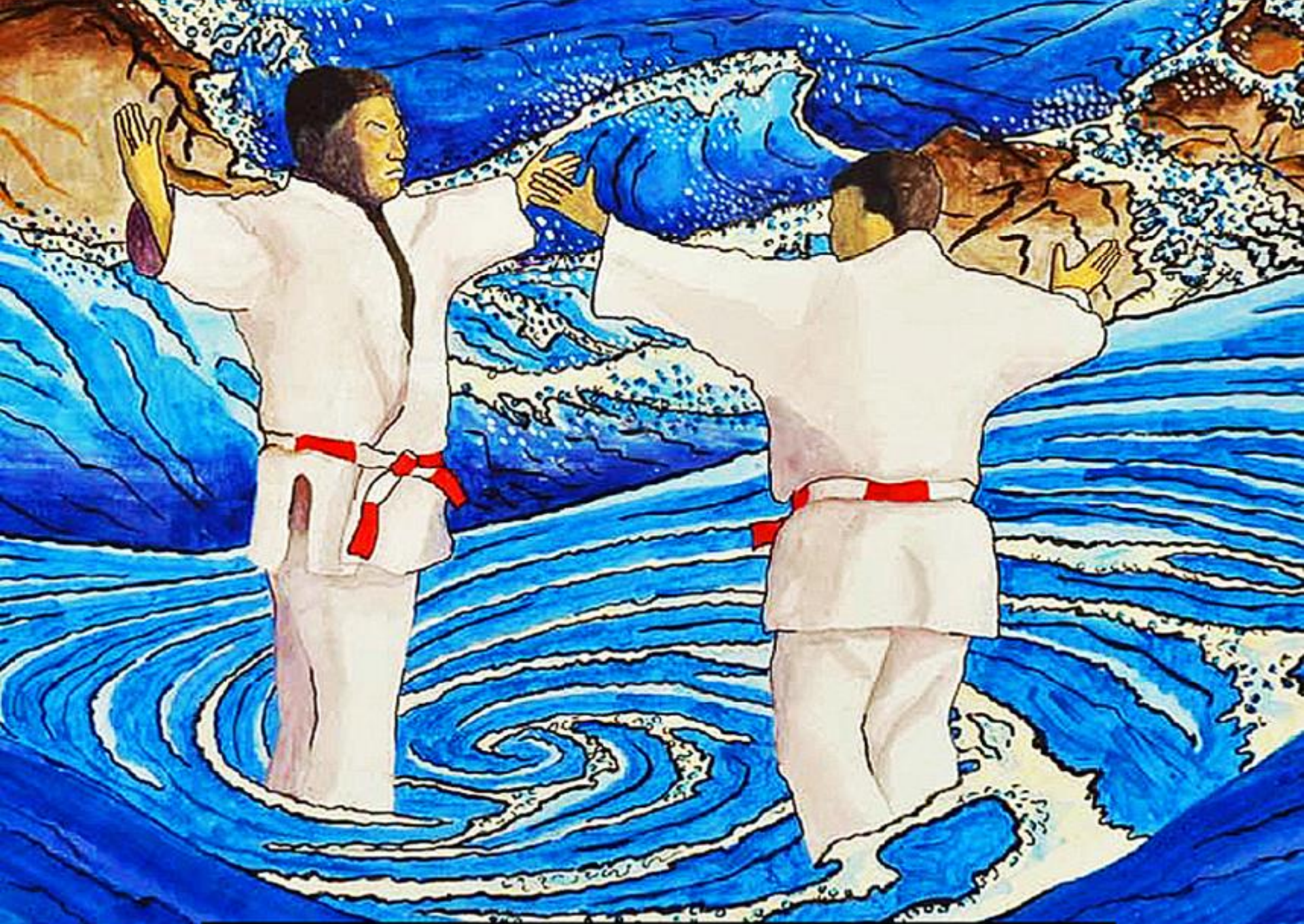
Sanbonme 三本目, the third technique from Itsutsunokata